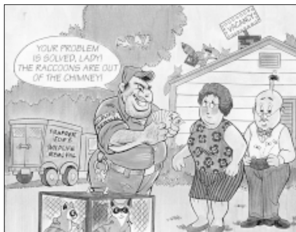
Don't pay for a cruel "solution" that won't work.

45 degree angle) to serve as a plank so the skunk can walk out. If the window well is deep, put on gloves and place smelly cat food or cheese in the far corner of a pet carrier or rectangular garbage can (tipped on its side) and slowly lower it into the window well. The skunk will be attracted to the food and will walk into it. Then slowly raise the carrier or can to ground level, elevator style, and let the skunk stroll out. Skunks have terrible eyesight and will not spray you if you move slowly and talk soothingly to them. Remember, skunks also give a warning by stamping their front feet, which gives you a chance to back off! Most importantly, purchase or make a window well cover out of mesh so this situation doesn't recur.