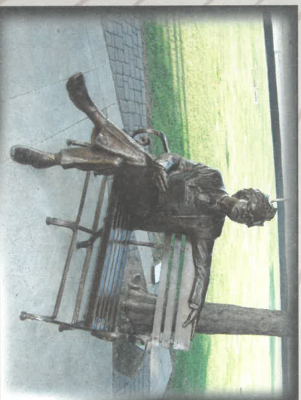
Mark Twain sculpture donated by Friends of the Rowlett Library