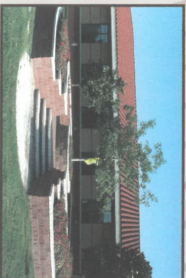
Flower garden donated by Friends of the Rowlett Library

Never underestimate the value of a "Friend"